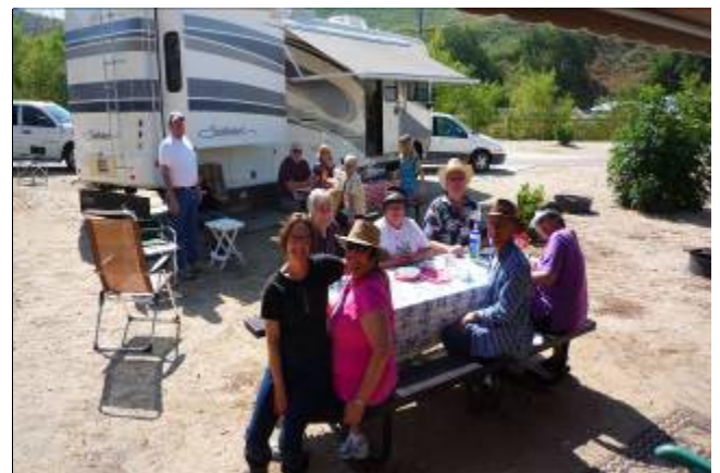
Sunday morning is always fun!