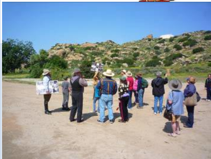
The Weakenders tour Corriganville