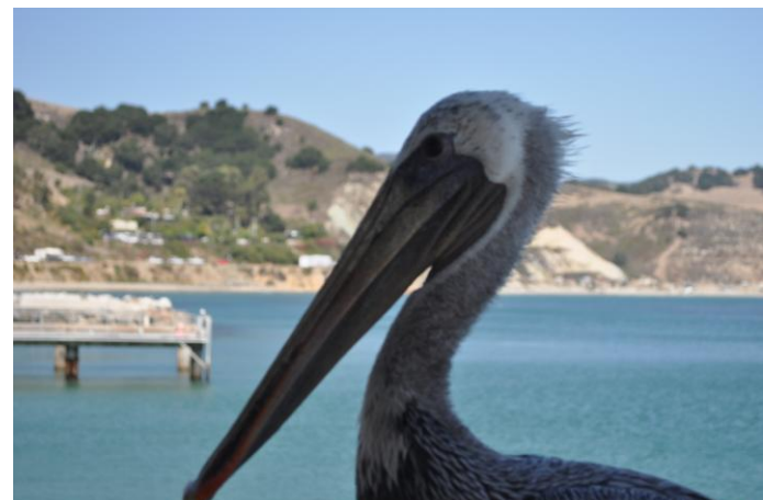
Making a new friend