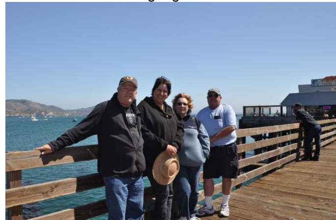
An outing to San Luis Pier