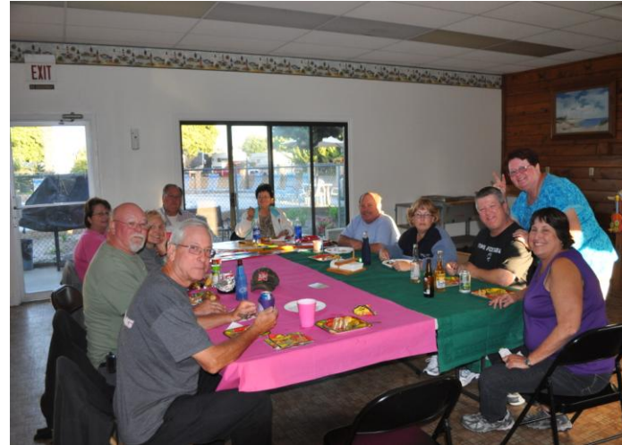
Having a great time!